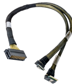
Cable Option – Internal Connection